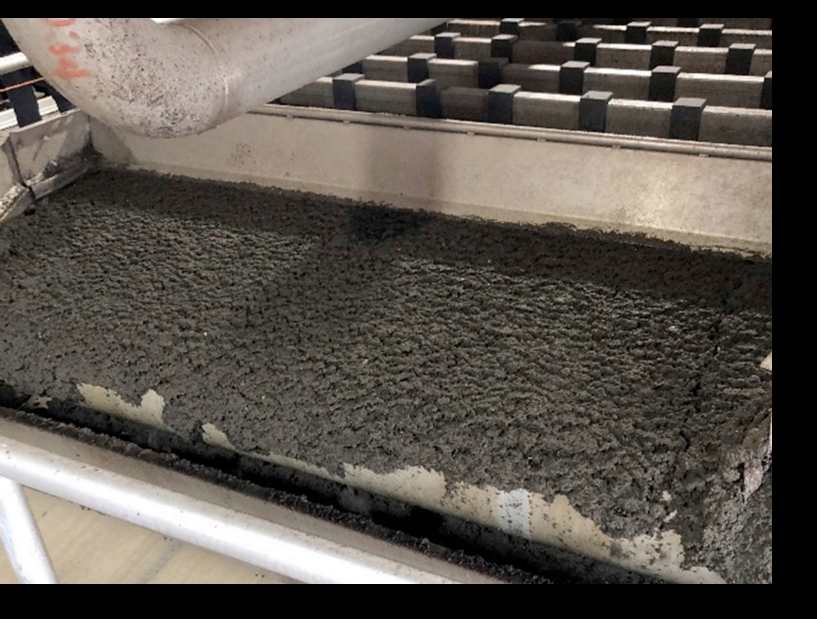
Low-quality wet sludge from previous dry polymer system