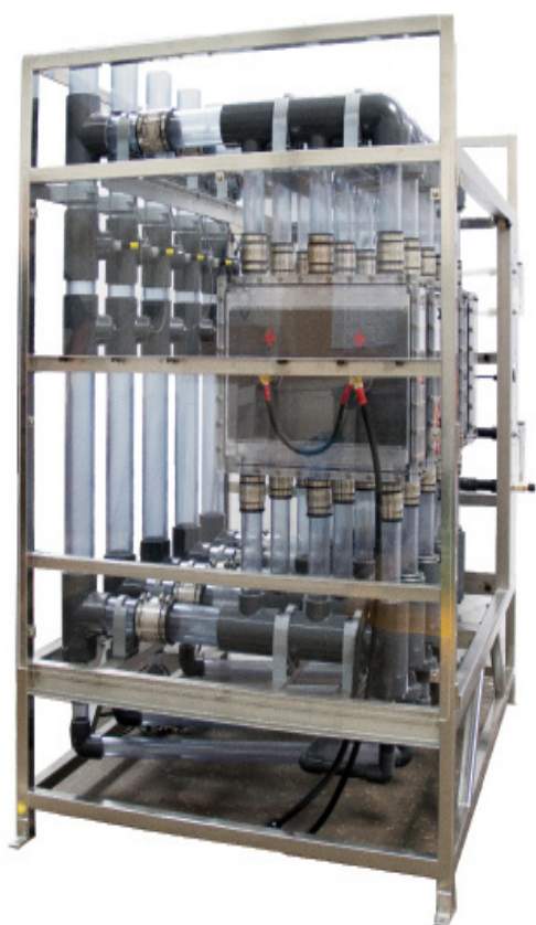
Microclor® MC-1000 1,000 Pounds Per Day